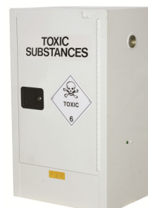
Storage Cabinet AU25712T Capacity 60 Lt AU25714T Capacity 30 Lt Single Door