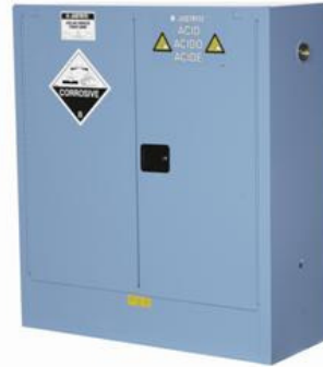
Storage Cabinet CAT.NO. AU25302B Capacity 160 Lt 2 Shelves 6 x 20 Litre Containers