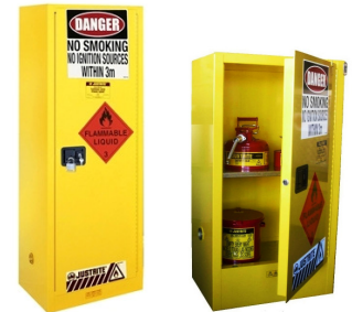
New Slim Line Storage Cabinets CAT.NO. AU25304 / AU25308 Capacity: 110 & 170 Litre