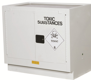
Storage Cabinet CAT.NO. AU25748T Capacity 100 Litre 2 Shelves