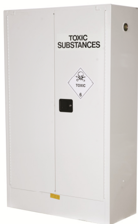
Storage Cabinet CAT.NO. AU25452T Capacity 250 Litre 3 Shelves 9 x 20 Litre Containers

These Cabinets are manufactured for the safe storage of Toxic / Poisons. A Safety Shower and Eye / Wash must be installed where packages are opened. Comply with AS/NZ 4452 - Class 6