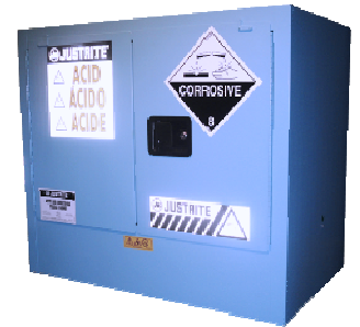
Storage Cabinet CAT.NO. AU25748B Capacity 100 Lt 2 Shelves