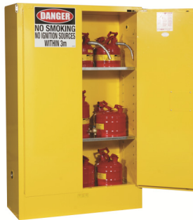
Safety Can Storage CAT.NO. AU25452 250Lt Capacity