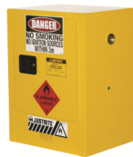
Compac Storage CAT.NO. AU25714 30Lt Capacity 2 Shelves