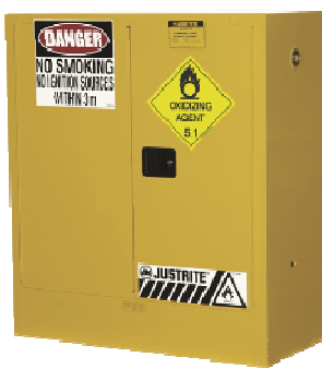
Storage Cabinet CAT.NO. AU25302OA Capacity: 160 Litre / 2 Shelves 6 x 20 Litre Containers