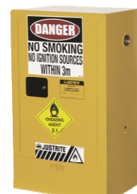
Storage Cabinet CAT.NO. AU25712OA Capacity 60 Lt CAT NO. AU25714OA Capacity 30 Lt Single Door