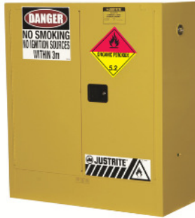
Storage Cabinet CAT.NO. AU25302OP Capacity 80 Litre 2 Shelves