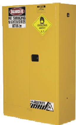
Storage Cabinet CAT.NO. AU25452OA Capacity: 250 Litre / 3 Shelves 9 x 20 Litre Containers

These Cabinets are manufactured for the safe storage of Oxidising Agents. A Safety Shower and Eye/Wash must be installed where packages are opened. Comply with AS 4326 - Class 5.1