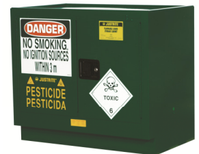
Storage Cabinet CAT.NO. AU25748P Capacity: 100 Litre 2 Shelves