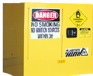
Storage Cabinet CAT.NO. AU25748OA Capacity: 100 Litre / 2 Shelves