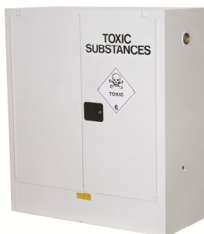
Storage Cabinet CAT.NO. AU25302T Capacity 160 Litre 2 Shelves 6 x 20 Litre Containers