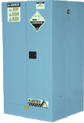
Storage Cabinet CAT.NO. AU25602B Capacity 350 Lt 3 Shelves 15 x 20 Litre Drums

These Cabinets are manufactured to comply with AS 3780 for the safe storage of Corrosive Substances.