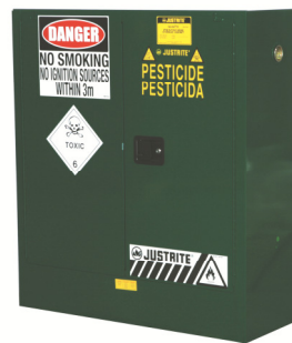
Storage Cabinet CAT.NO. AU25302P Capacity: 160 Litre 2 Shelves 6 x 20 Litre Containers