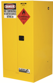
Safety Can Storage CAT.NO. AU25602 350Lt Capacity