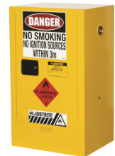
Safety Can Storage CAT.NO. AU25712 60Lt Capacity