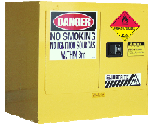
Storage Cabinet CAT.NO. AU25748OP Capacity 60 Litre 2 Shelves