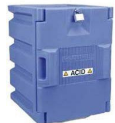
Polyethylene Storage Cabinet CAT.NO. AU24040 1 Shelf