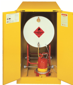
Horizontal Drum Storage CAT.NO. AU25662 207Lt Capacity 2 Door