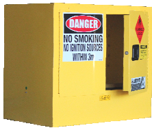
Under Bench Storage CAT.NO. AU25748 100Lt Capacity 2 Shelves