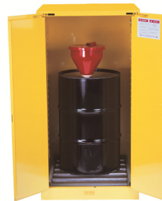
Vertical Drum Storage CAT.NO. AU25701 207Lt Capacity 2 Door with rollers