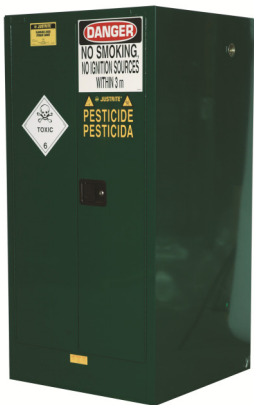
Storage Cabinet CAT.NO. AU25602P Capacity: 350 Litre 3 Shelves 15 x 20 Litre Containers

These Cabinets are manufactured for the safe storage of Pesticides. A Safety Shower and Eye/Wash must be installed where packages are opened.