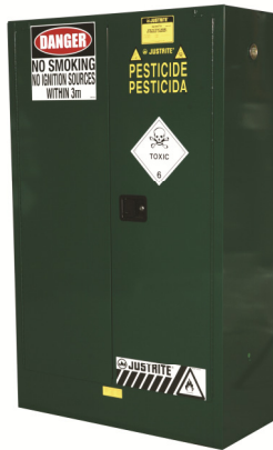
Storage Cabinet CAT.NO. AU25452P Capacity: 250 Litre 3 Shelves 9 x 20 Litre Containers