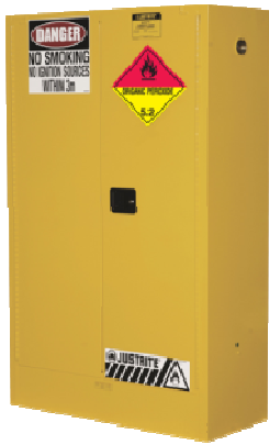
Storage Cabinet CAT.NO. AU25452OP Capacity 100 Litre 3 Shelves

These Cabinets are designed to comply with AS 2714 and have a sump capacity equal to the total of the contents of the Cabinet. They are designed so that in the event of pressure build up the doors will open outwards. The doors are held closed by fiction type mechanism. For this reason the maximum capacity of a Cabinet is 100 kg or 100 L.