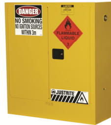
Safety Can Storage CAT.NO. AU25302 160Lt Capacity