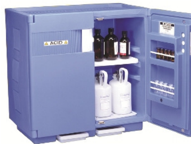
Polyethylene Storage Cabinet CAT.NO. 24160 Capacity: 30 Lt 2 Shelves