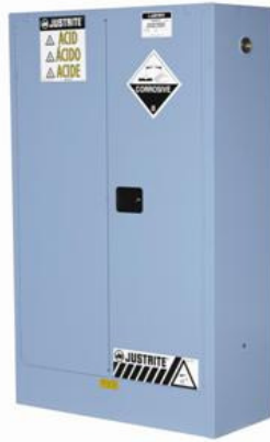
Storage Cabinet CAT.NO. AU25452B Capacity 250 Lt 3 Shelves 9 x 20 Litre Containers