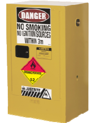
Storage Cabinet CAT.NO. AU25712OP Capacity 50 Lt Single Door